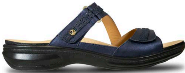
NEW Sapphire / Navy Lizard

MSRP: $139.95 WIDTH: Medium only SIZES: Full Sizes 5 to 12 US ADJUSTABILITY: 2 Straps