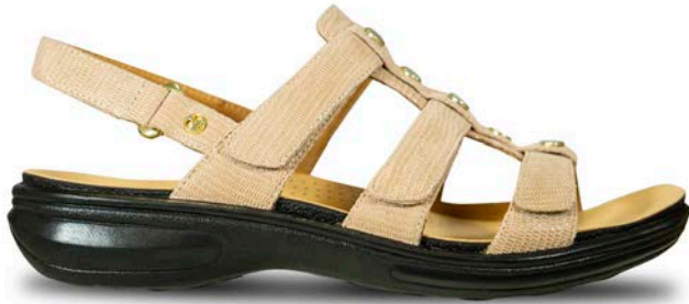
NEW Biscuit (Medium Width Only)

MSRP: $149.95 WIDTH: Medium & Wide SIZES: Full Sizes 5 to 12 US ADJUSTABILITY: 4 Strap T-Bar with stud accents and trim marks on the back strap