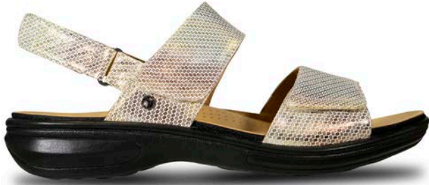
NEW Metallic Interest (Medium Width Only)

MSRP: $149.95 WIDTH: Medium & Wide SIZES: Full Sizes 5 to 12 US ADJUSTABILITY: 3 Straps including trim mark on back strap