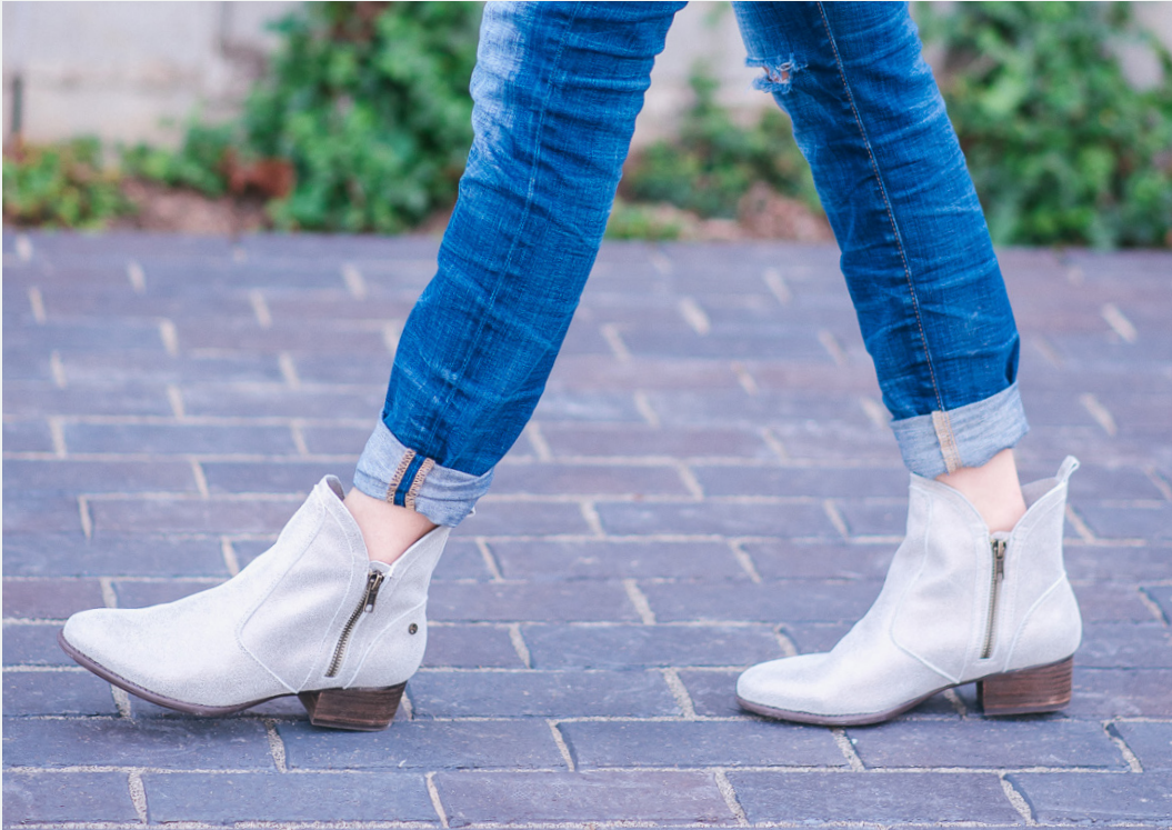
Featured style: Siena