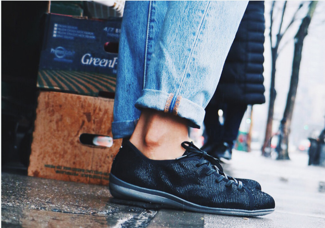
Featured style: Lyon