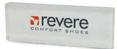
Acrylic Logo Block