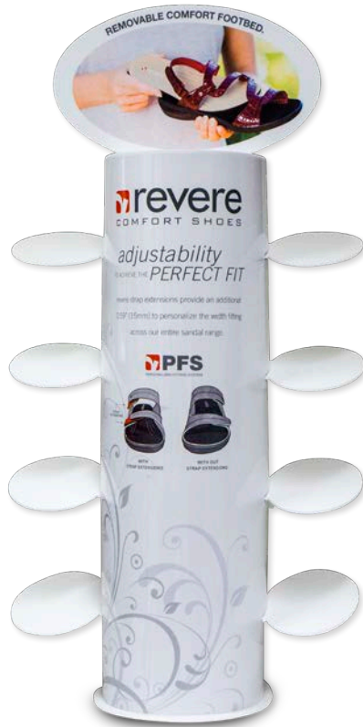
8 Shoe Table Top Stand with interchangeable, Seasonal Header