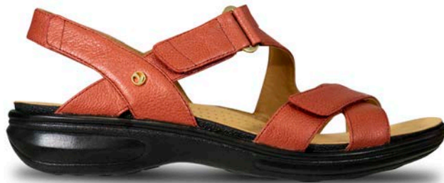
NEW Ruby Metallic (Medium Width Only)

MSRP: $149.95 WIDTH: Medium & Wide SIZES: Full Sizes 5 to 12 US ADJUSTABILITY: 3 Straps