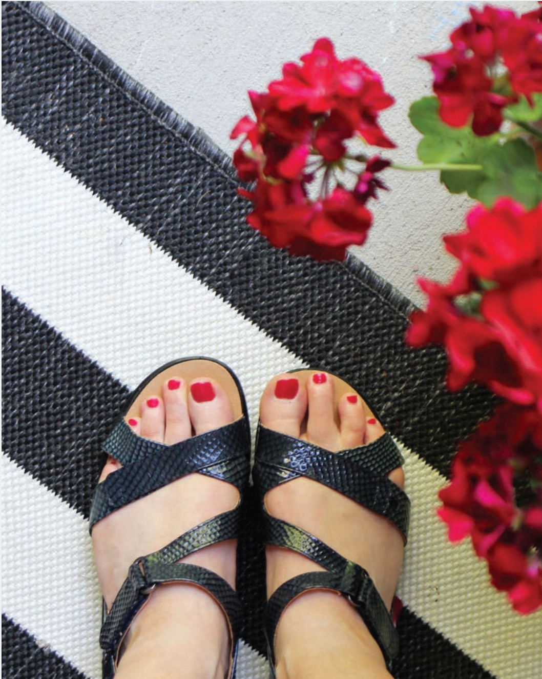
Photo: Julie of The girl in the red shoes. Featured style: Zanzibar