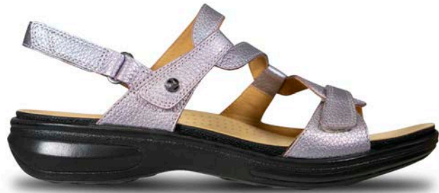
NEW Lilac (Medium Width Only)

MSRP: $149.95 WIDTH: Medium & Wide SIZES: Full Sizes 5 to 12 US ADJUSTABILITY: 3 Straps including trim marks on back strap