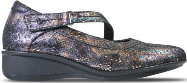
Black Metallic Python

MSRP: $139.95 WIDTH: Medium & Wide SIZES: Full Sizes 5 to 12 US ADJUSTABILITY: Single strap