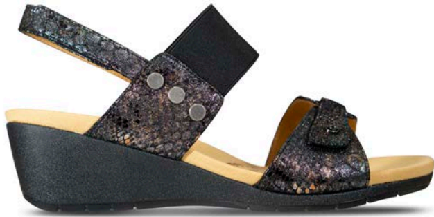
Black Metallic Python

MSRP: $139.95 WIDTH: Medium only SIZES: Full Sizes 5 to 12 US ADJUSTABILITY: 2 Straps plus elastic stretch. Back strap includes trim mark