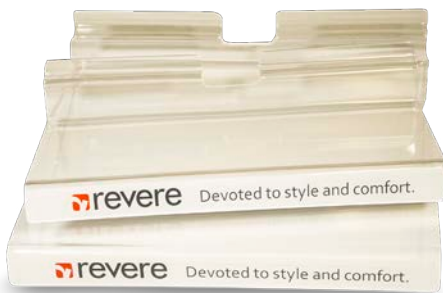
Branded Slatwall Shelves