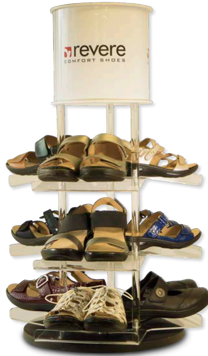
Table Top Spinner Stand