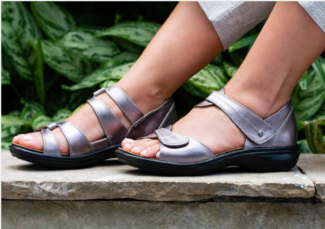
Featured style: Geneva